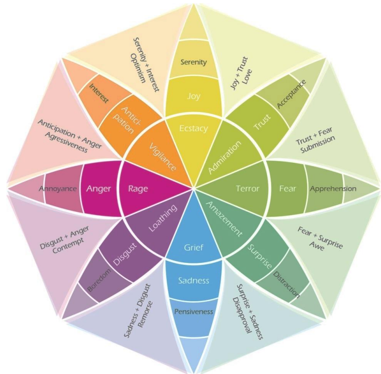
Figure 1: A 3D and a flattened view of Plutchik's Emotion Solid

A constraint of models like OCC is the static number and type of emotions. While it is theoretically possible to extend these models to include additional emotions, there are no defined guidelines on how to do so. This can lead to some difficult design problems, specifically when adding an emotion that is not adequately described by one of the existing types. PES provides a method, analogous to the colour wheel, for creating new emotion types using the primary emotions and, optionally, their intensities (Table 1). For example, mixing the primary emotions of disgust and anger creates the secondary emotion contempt , combining the feelings of rejection and destruction. This flexibility allows designers to include and exclude non-primary emotions as needed, a luxury that has not been afforded by other models.